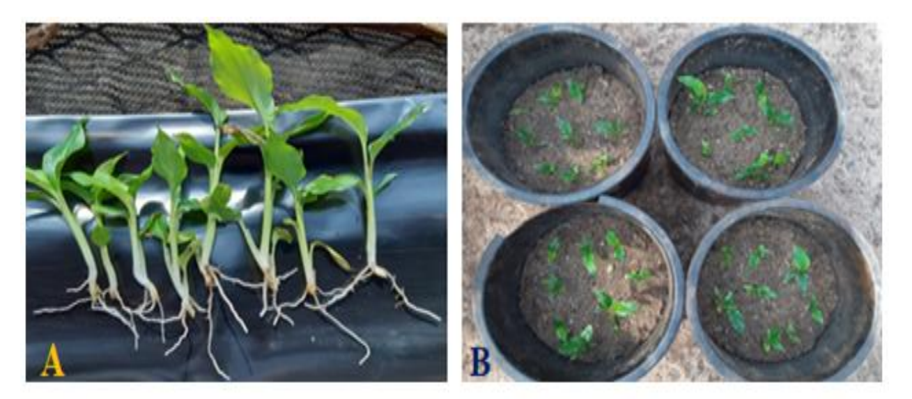
Figure 6: Ex vitro hardening off (A) Removing of gel from the root and (B) planting in sand soil