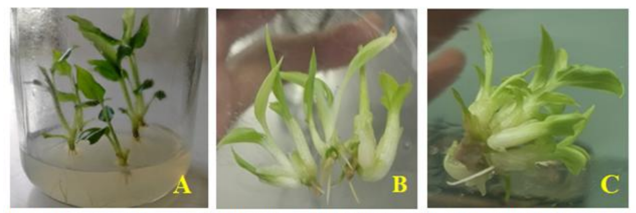
Figure 3: Control (A), shoot multiplication on MS medium supplemented with BA 2.0 mg/l and KN 1.0 mg/l from in vitro regenerated seeding shoot tip explants (B), BA 3.0mg/l and KN 0.5mg/l (C)