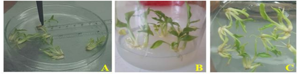
Figure 4 : Shoot multiplication on MS medium supplemented with BA 1.0mg/l (A), BA 2.5mg/l and KN 1.0mg/l (B), BA 2.0mg/l (C)