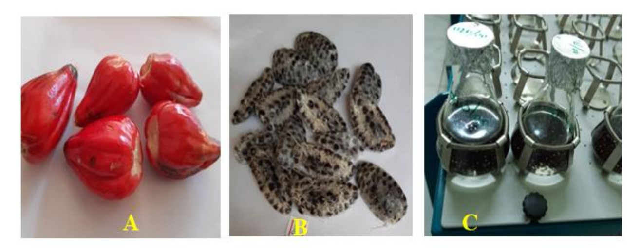
Figure 1: Ripened, red capsules of A. corrorima (A). Seeds of A. corrorima in aggregates (B) A. corrorima seeds soaked in GA3 (250mg/l) in (C)